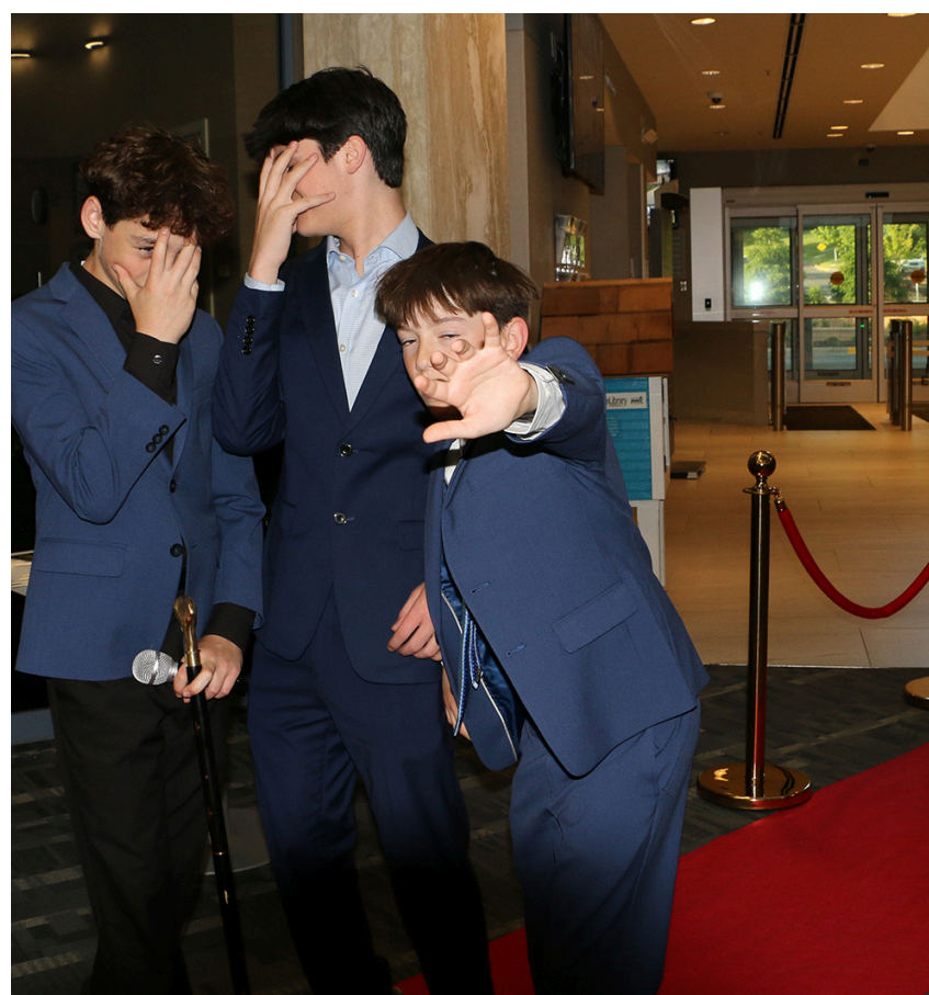
The Fourth Annual Marty Awards will be held Saturday May 9, at the JCC.